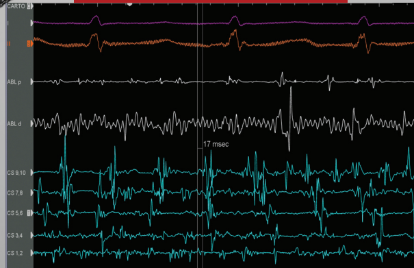
Cardiac signals with common power cable