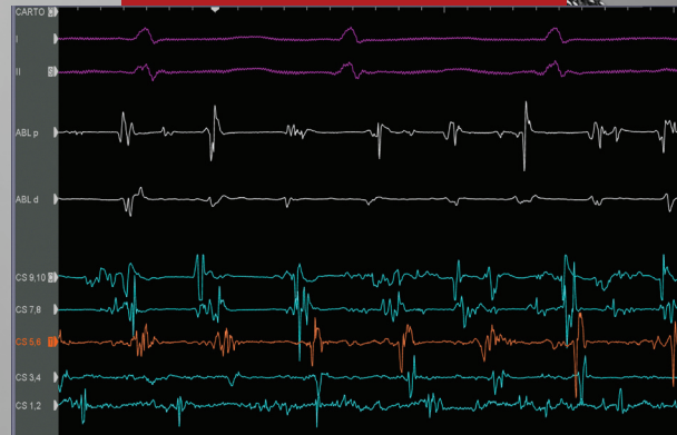
Cardiac signals with NR Technology power cable