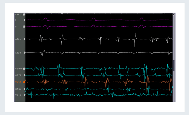
COMPARISON AFTER: Intercardiac tracings with filter. No 60hz noise on ABL d, baseline noise on CS tracings gone. ECG II,III still have 180 hz noise, but much better